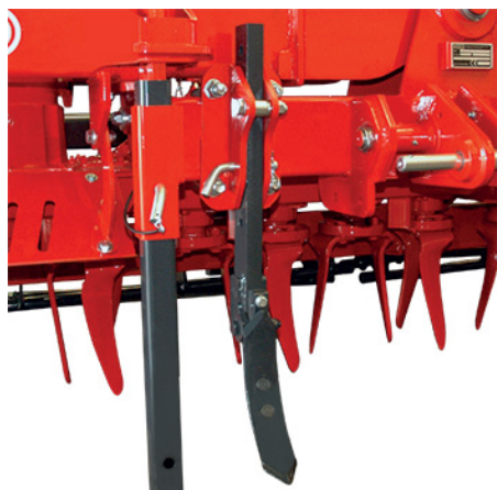
Track eradicator with security pin