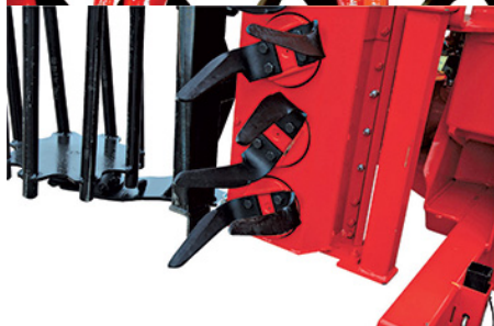
Total stone protection VX-VZ-DB