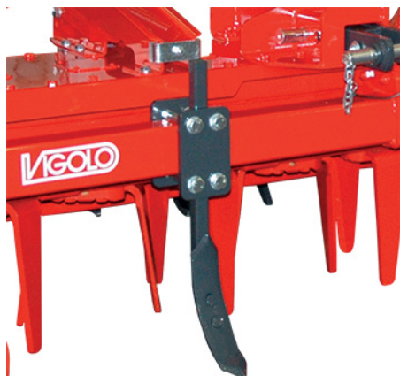
Rigid track eradicator