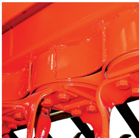
Total stone protection EN