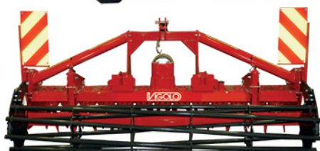
Road tables kit